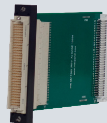
DAK 563584 Shielded, matched trace length PCB, 160 position connector. For Keysight instruments: E8782A, E8783A