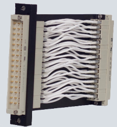
DAK 563587 Matched cable length, 48 position DIN connector. For Keysight instruments: E6175A, E6176A, N9377A E6177A, N9378A, U7177A, U7179A